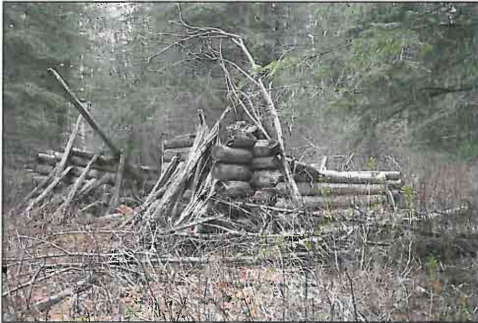
Abandoned trapper's cabin along the Porcupine Road.