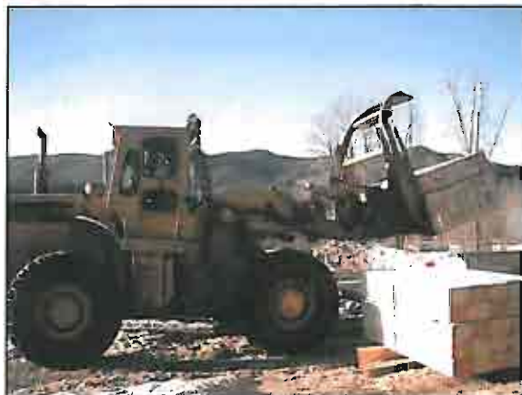
Scenes from Sheraton Holdings Ltd.’s sawmill east of Burns Lake.