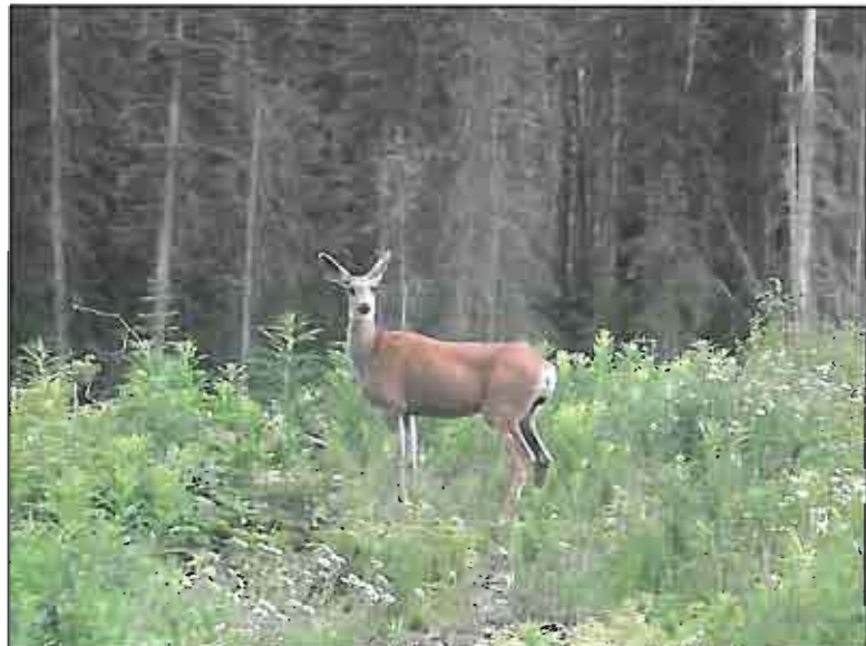
Mule deer in an old cut block.